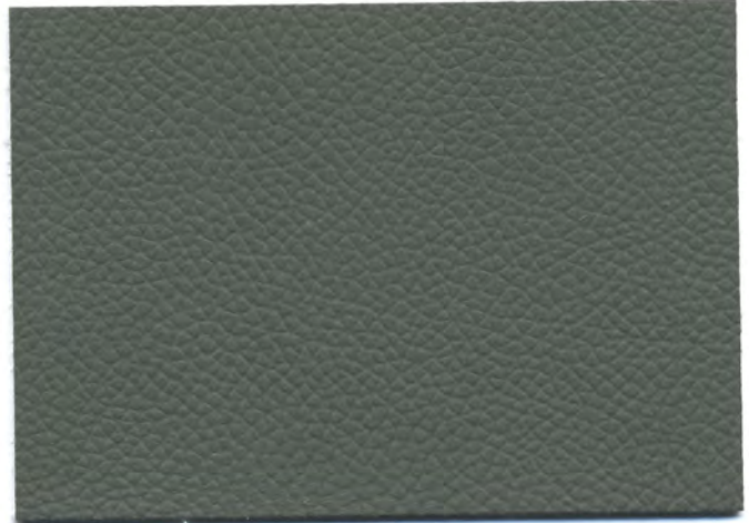
LNG313N Dark Titanium