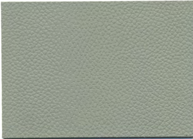
LNG311N Light Titanium