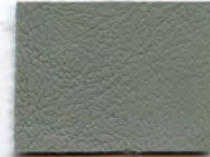
AL-856 Pearl Grey