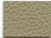
PRO-682 Light Neutral