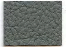
PRO-677 Medium Grey