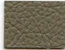
PRO-685 Light Sandlewood