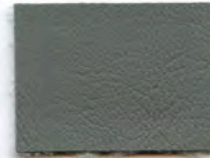
AL-870 Medium Grey