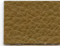
PRO-687 Empire Tan