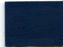
AL-821 Regimental Blue