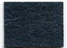
CR-501 Steel Blue