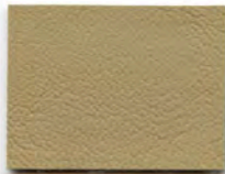
AL-864 Light Sand