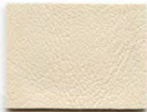
AL-827 Sea Oyster