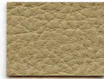
PRO-684 Light Sand