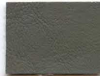
AL-835 Dark Pewter