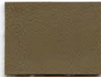
AL-876 Medium Beige