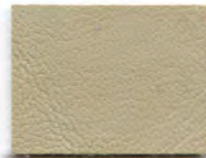
AL-854 Light Parchment