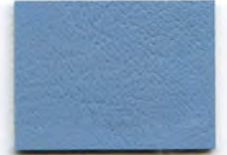
AL-896 Sea Cruise