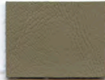
AL-874 Light Sandlewood