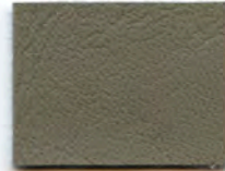
AL-872 Medium Neutral