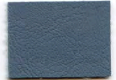
AL-816 Cadet Blue