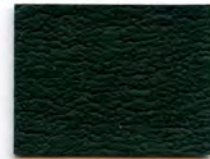
CR-503 Forest Green