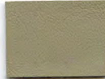
AL-862 Light Neutral