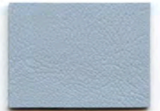
AL-893 River Blue