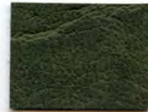
CR-502 Dark Green