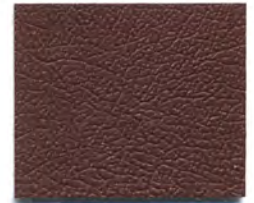
VC400 Cinnamon Glaze