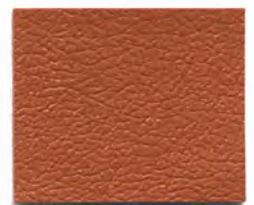
VC405 Tiger's Eye