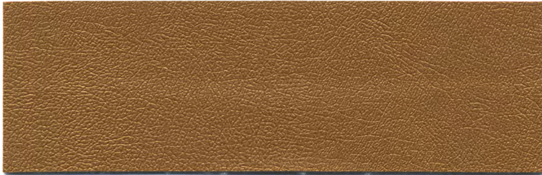
VC421 Russian Tea