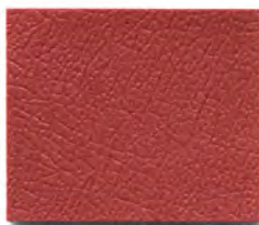
VC401 Candy Apple