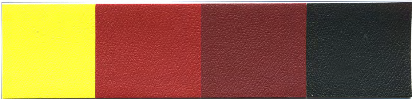
FL-8415 LEMON PEEL