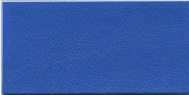
FL-8542 ROYAL BLUE