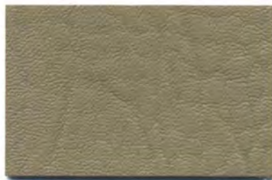
FL7098 Med. Prairie Tan