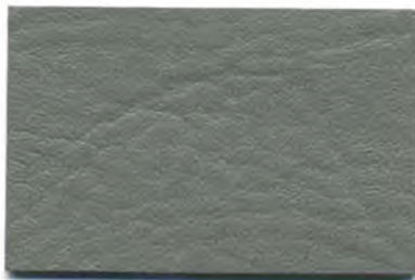
FL6952 Med. Graphite