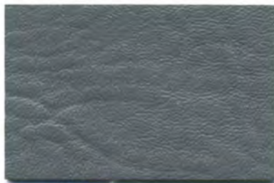
FL6688 Med. Opal