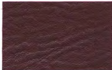
FL6430 Currant Red