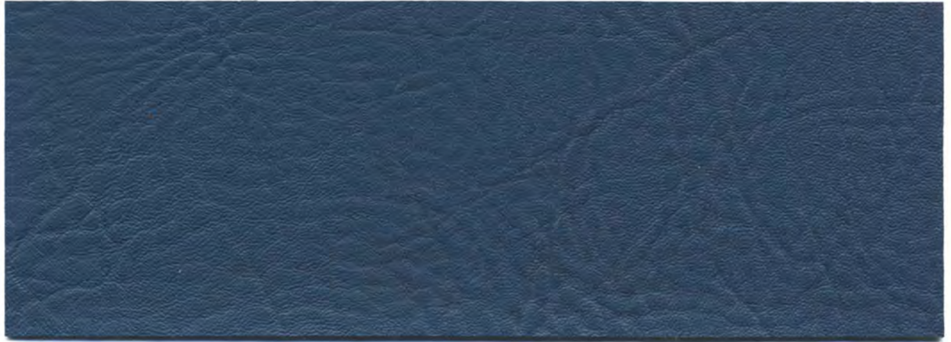
FL6812 Lapis Blue