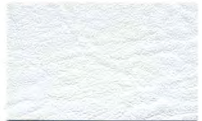
FL9999 Snow White