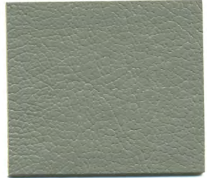
FL-7225 MED. TRUFFLE