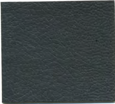
FL-7170 MIDNIGHT BLACK