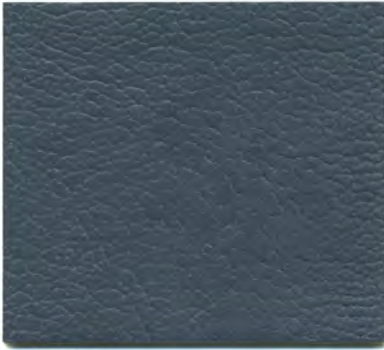
FL-7168 DK. DENIM BLUE