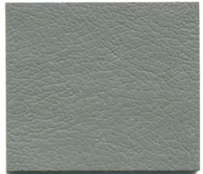
FL-7114 MED. GRAPHITE