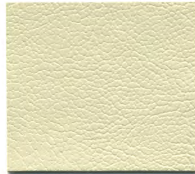
FL-7220 LT. PARCHMENT