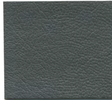
FL-7222 DK. GRAPHITE