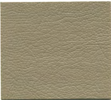
FL-7167 MED. PRAIRE TAN