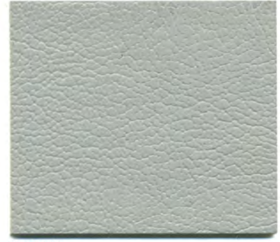
FL-7119 LT. GRAPHITE