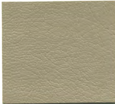
FL-7221 MED. PARCHMENT