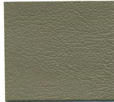
FL-7275 MED. DK. PARCHMENT