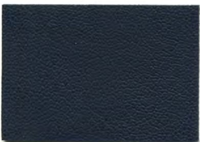
FL-6899 MONTANA BLUE