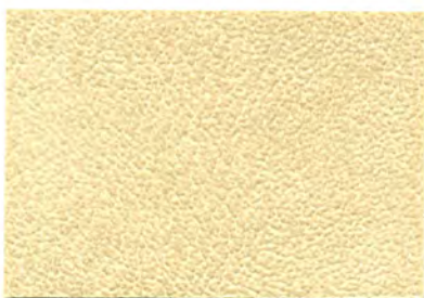
FL-0111 FRENCH VANILLA