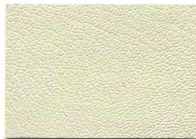
FL-7237 LT. WHEAT