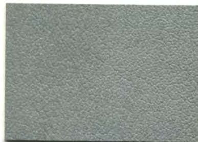
FL-5033 DOVE GRAY