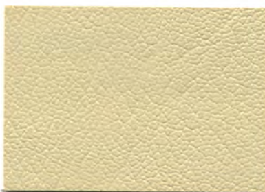
FL-6984 CAPPUCCINO CREAM