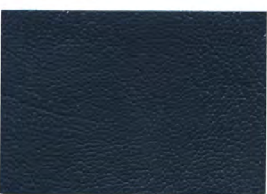
FL-0103 CHAR BLUE