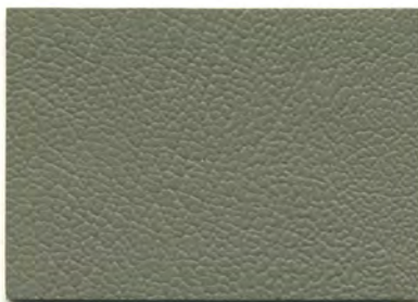
FL-7124 MED. PEWTER