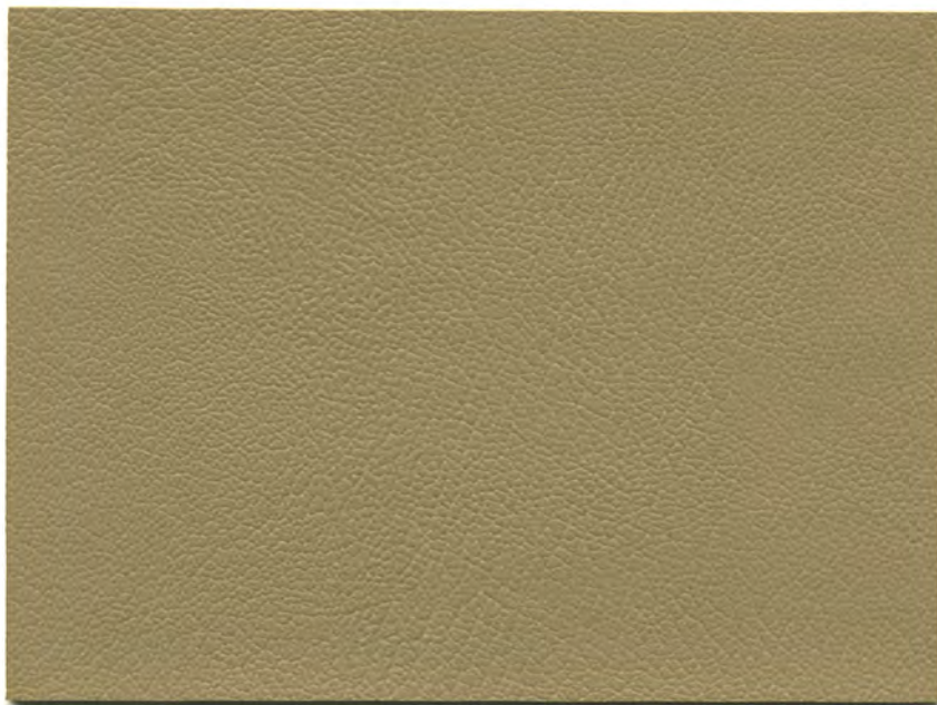
FL-7182 LT. OAK