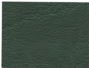
CR503 FOREST GREEN