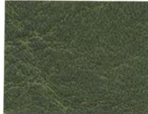
CR502 DARK GREEN