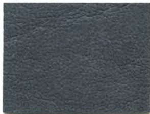
CR501 STEEL BLUE