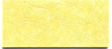
DOL 78 Citrus