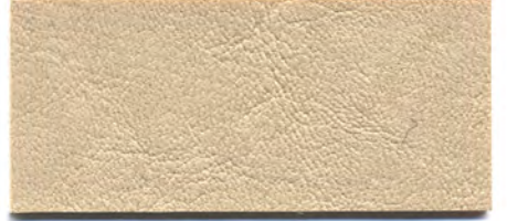
DOL 91 Smokewood