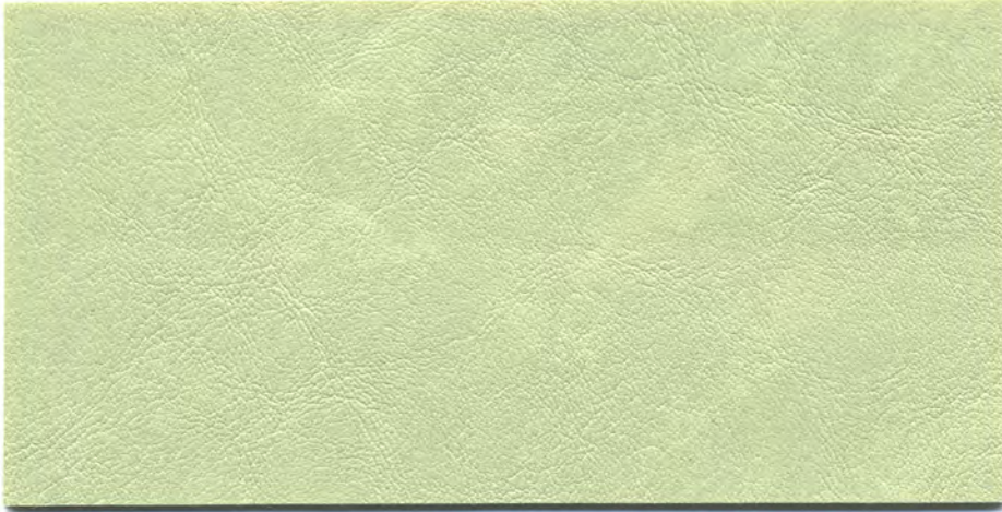
DOL 90 Willow