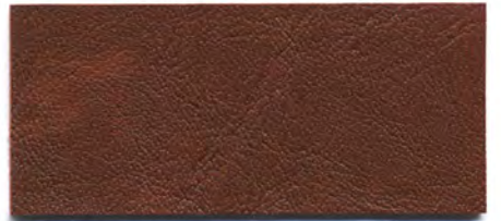
DOL 89 Terra Cotta