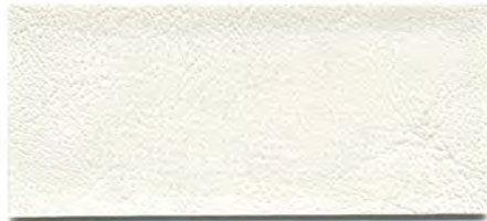
DOL 72 White