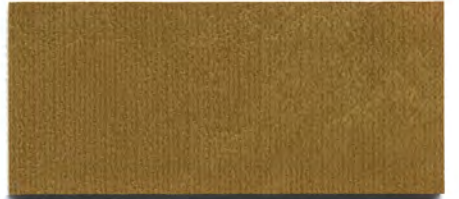
DOL 73 Bark