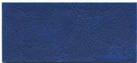
DOL 76 Navy