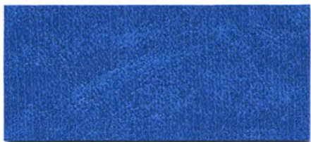
DOL 71 Blue