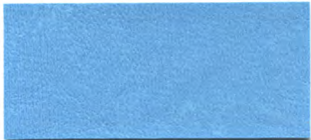
DOL 82 Lt. Blue