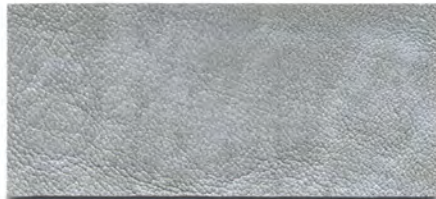
DOL 92 Dover Mist