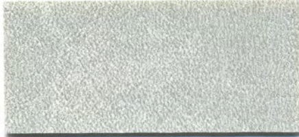
DOL 81 Seamist