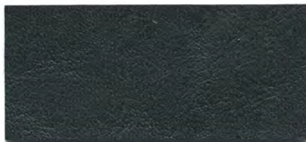
DOL 87 Blackwatch