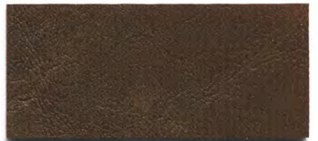
DOL 74 Teak