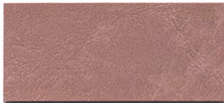
DOL 93 Mauve/Rose