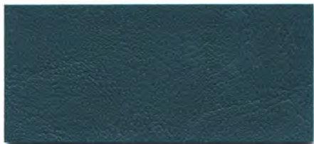
DOL 88 Nile Blue