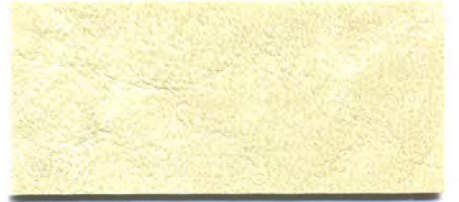
DOL 75 Sand