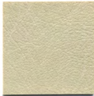
BB 52 Ash