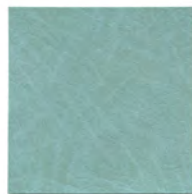
BB 66 Laurel