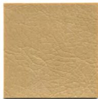
BB 54 Wheat