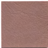
BB 63 Mauve