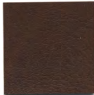
BB 57 Florentine Brown