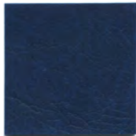
BB 61 Royal Navy