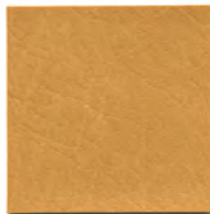
BB 56 Copperwood