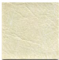
BB 53 Bone