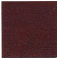
BB 62 Burgundy