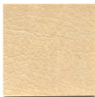
BB 55 Bisque