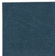
BB 60 Dusk