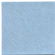
BB 64 Delft