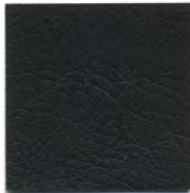
BB 59 Ebony