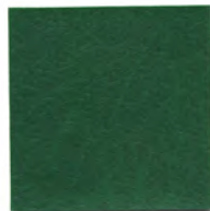
BB 67 Vine