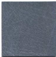
BB 58 Sterling