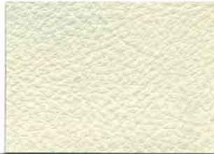
Off White HIG-0316