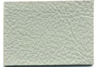
Lt. Grey HIG-0312