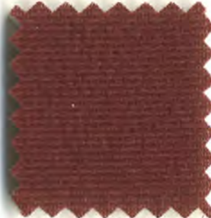
MH 1932 Dk Red