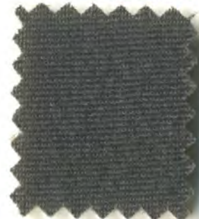
MH 1883 Dk Gray