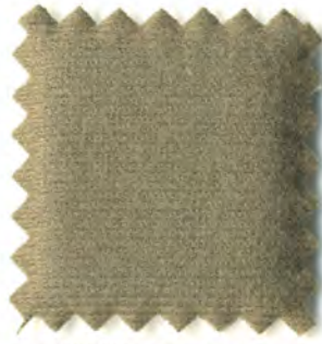
MH 2081 Med Neutral