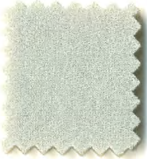
MH 1764 Slate