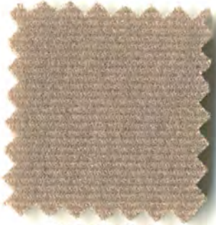
MH 1953 Lt Mocha