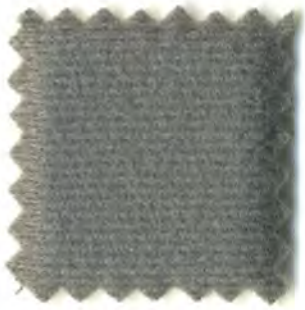
MH 1853 Smoke