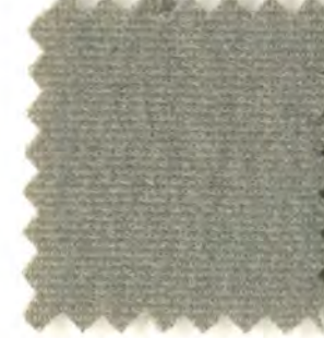
MH 1904 LT Charcoal