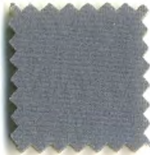
MH 1908 Crystal Blue