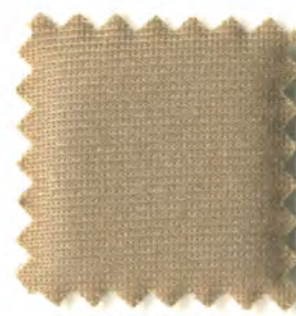
MH 2040 Oak