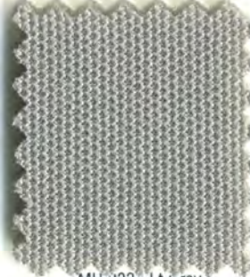
MH 2334 Lt Gray Providence