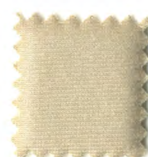
MH 2117 Cypress