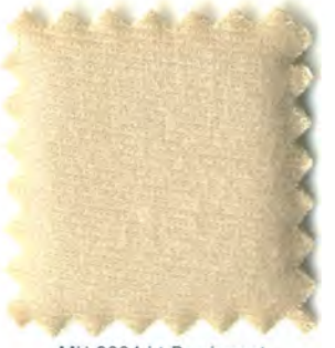
MH 2224 Lt Parchment