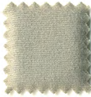
MH 1784 Sand Gray