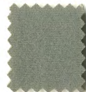
MH 2005 Med Gray