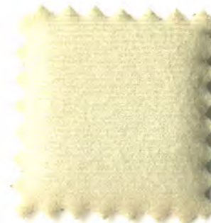
MH 1747T Lt Quicksilver