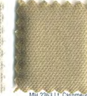
MH 2363 Lt. Cashmere Providence