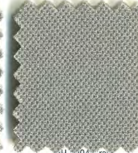
MH 2294 Gray Winchester