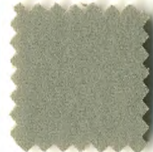
MH 1891 Titanium