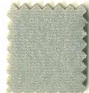
MH 1747 Quicksilver