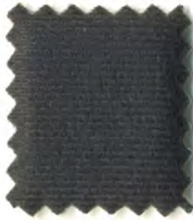
MH 2001 Graphite