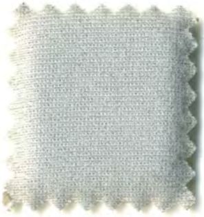
MH 1808 Ox Gray