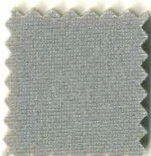
MH 2058 Lt Opal