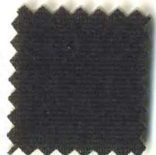
MH 1871 Shadow Blue