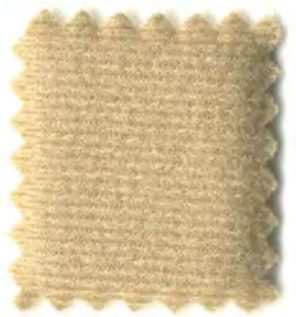
MH 1912 Buckskin