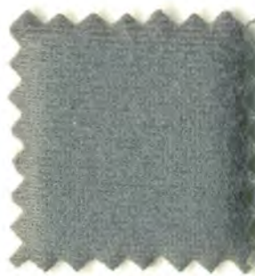
MH 1810X Ash Gray