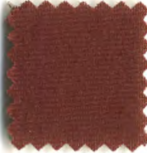
MH 1714 Maple