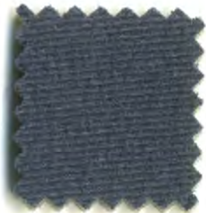
MH 1879 Sapphire