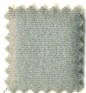
MH 2075 Lt Graphite