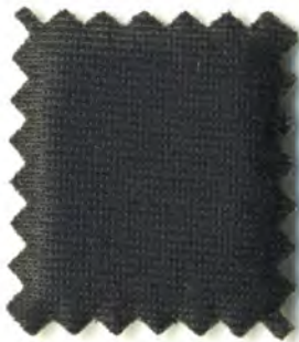
MH 1753 Dk Charcoal