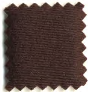
MH 1666 Claret