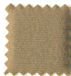
MH 1811 Med Beige