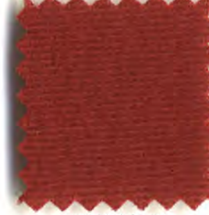
MH 1872 Scarlet