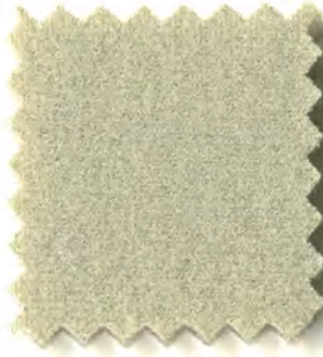
MH 2144 Shale