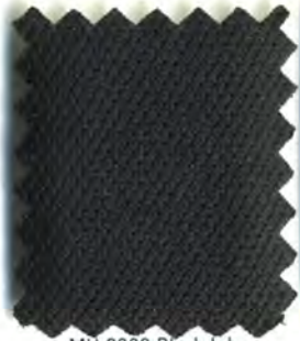
MH 2300 Black Ink Prismatic