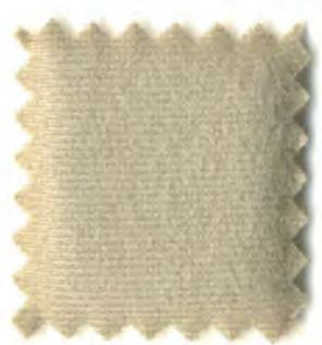
MH 2037 Lt Natural