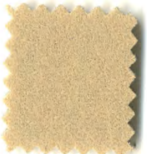
MH 1971 Dk Sand