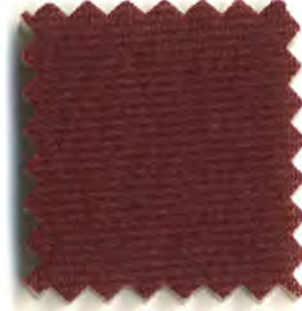
MH 2096 Rubylene