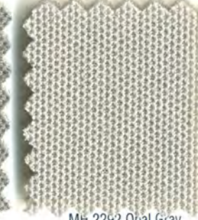
MH 2292 Opal Gray Winchester