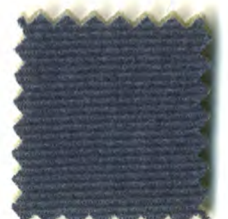
MH 2092 Dk Navy