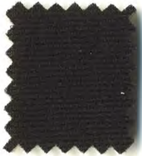
MH 1559 Black

COLORS MAY VARY SLIGHTLY WITH EACH DYE LOT