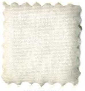
MH 1600 White