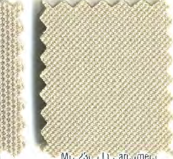
MH 2365 Lt. Argonite Prismatic