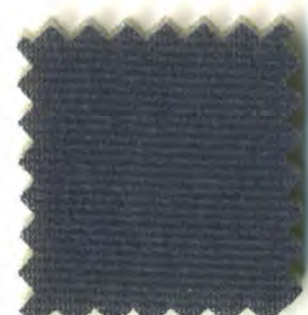
MH 1690 Blue