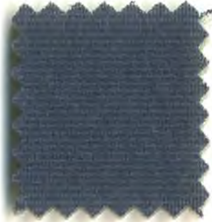
MH 1884 Dk Blue