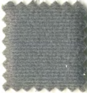
MH 1810 Med Dk Gray