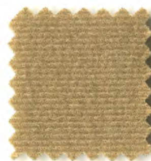
MH 2127 Saddle Tan