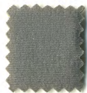
MH 2076 Med Graphite