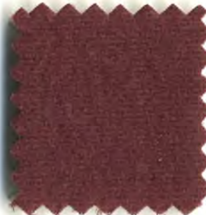
MH 1855 Garnet