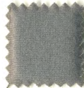
MH 2000 Med Opal