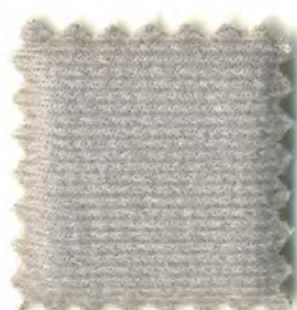
MH 1955 Lt Gray