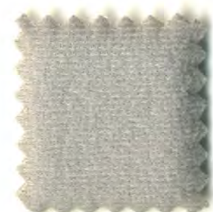
MH 1927 Lt Titanium