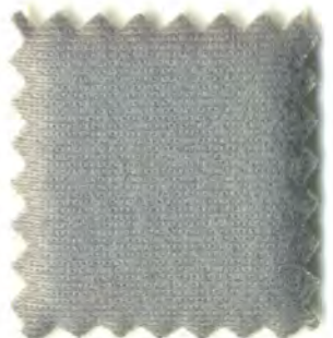
MH 2068 Clear Gray