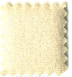
MH 1625 Off White