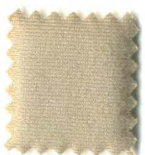
MH 2013 Lt Driftwood