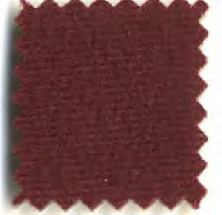
MH 1998 Dk Ruby