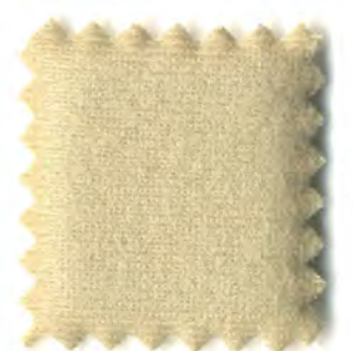
MH 2002 Lt Neutral